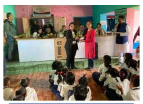
Basic Education & Literacy