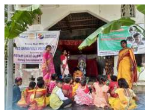
Saraswati Puja at our School at Sunderban