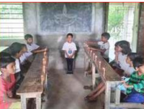
Our School at Shamsher Nagar Sunderban