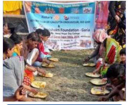
Food Distribution at Gansagar Mela (Peace3)