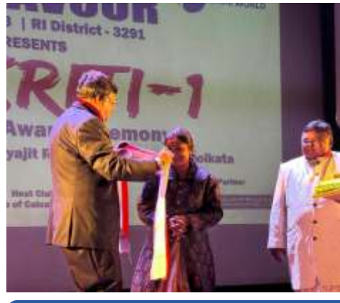
Shikriti - Vocational Award