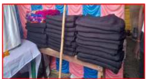
Blanket Distribution at Ganga Sagar Mela